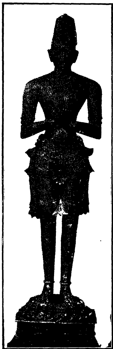
Emperor Krishna Devaraya (From Srinivasa Swami Temple, Tirupati Hill)